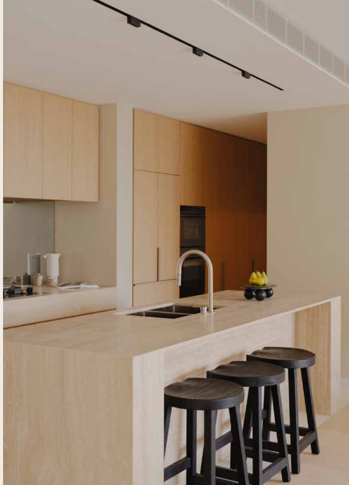
Right image – Kitchen benchtop and butlers pantry