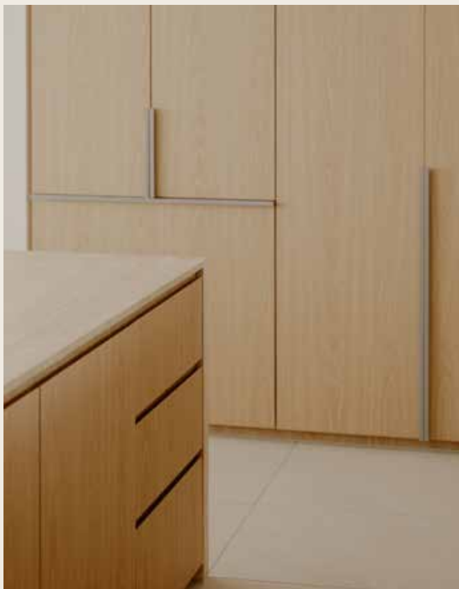
Left image – Kitchen cabinet and bench detail