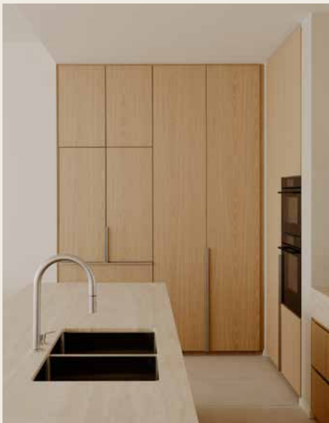
Left image – Kitchen cabinet, benchtop and VZUG appliances