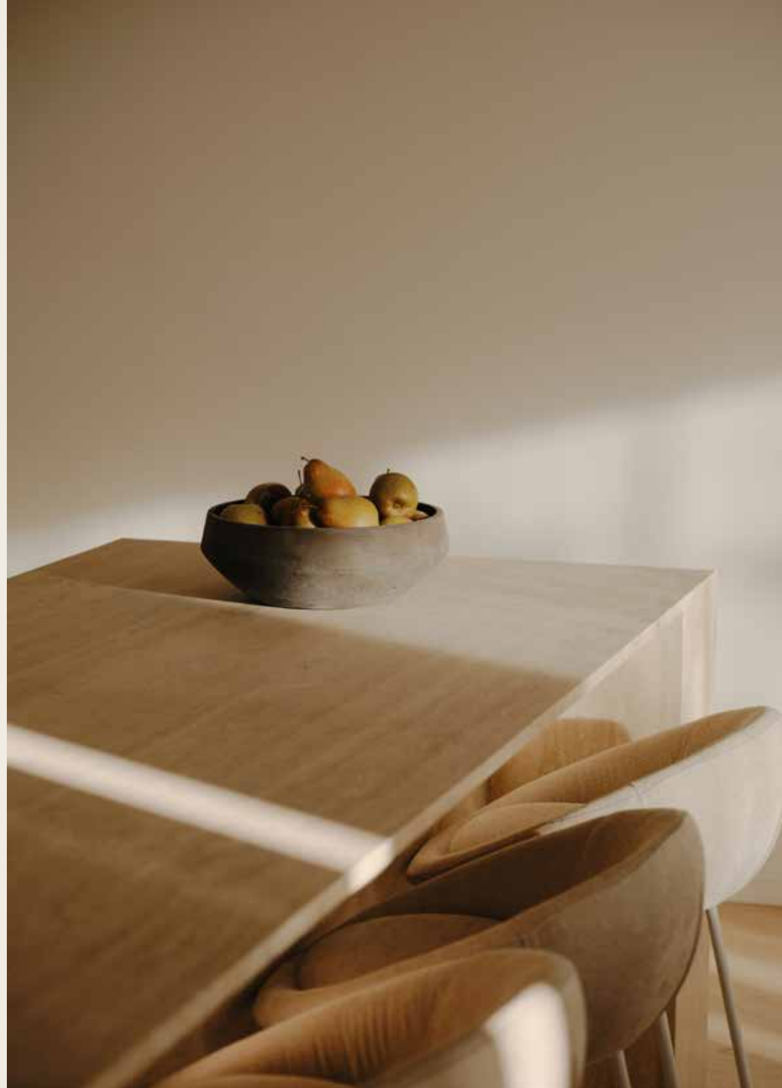
Right image – Kitchen benchtop